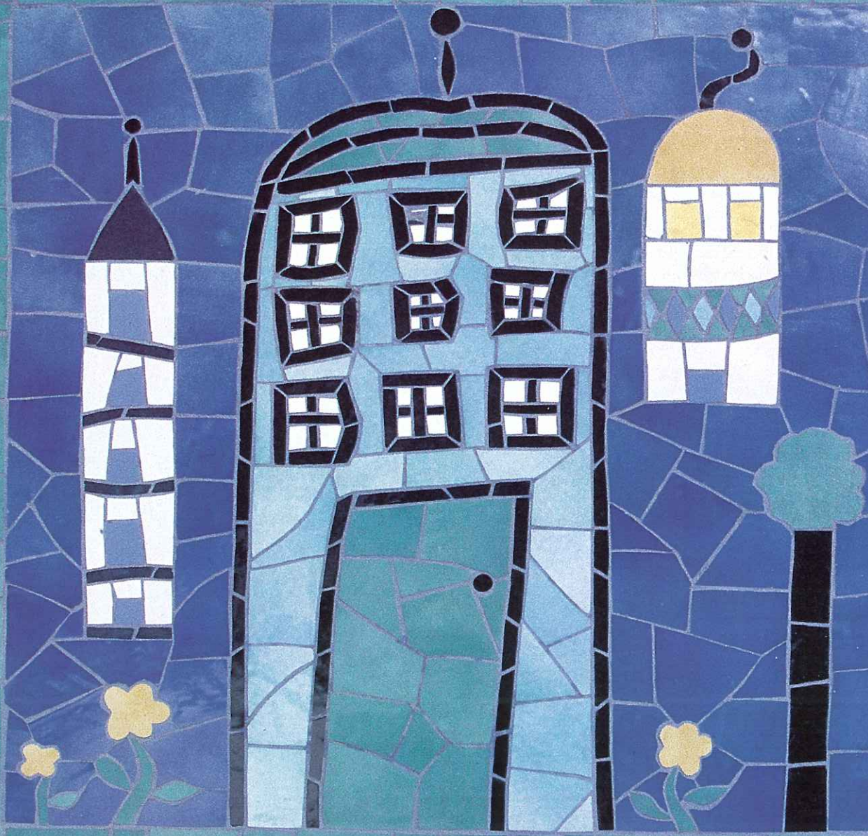
A Percent for Art project for the Education Department of Western Australia